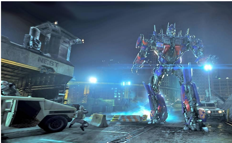
Optimus Prime, leader of the Autobots, prepares for battle with the Decepticons.