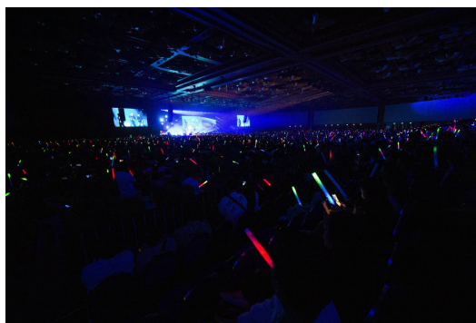
Westlife got the audience at Resorts World Sentosa grooving to the energetic beats of their hit songs.

The audience was treated to an unforgettable experience elevated by Westlife's vocal prowess and charismatic exchanges, making it a night to remember. Cheered on by the audience throughout the night, Westlife proved to be a crowd-pleaser as they delivered a remarkable performance belting out their signature tunes such as My Love , Flying Without Wings , When You're Looking Like That , and If I Let You Go .