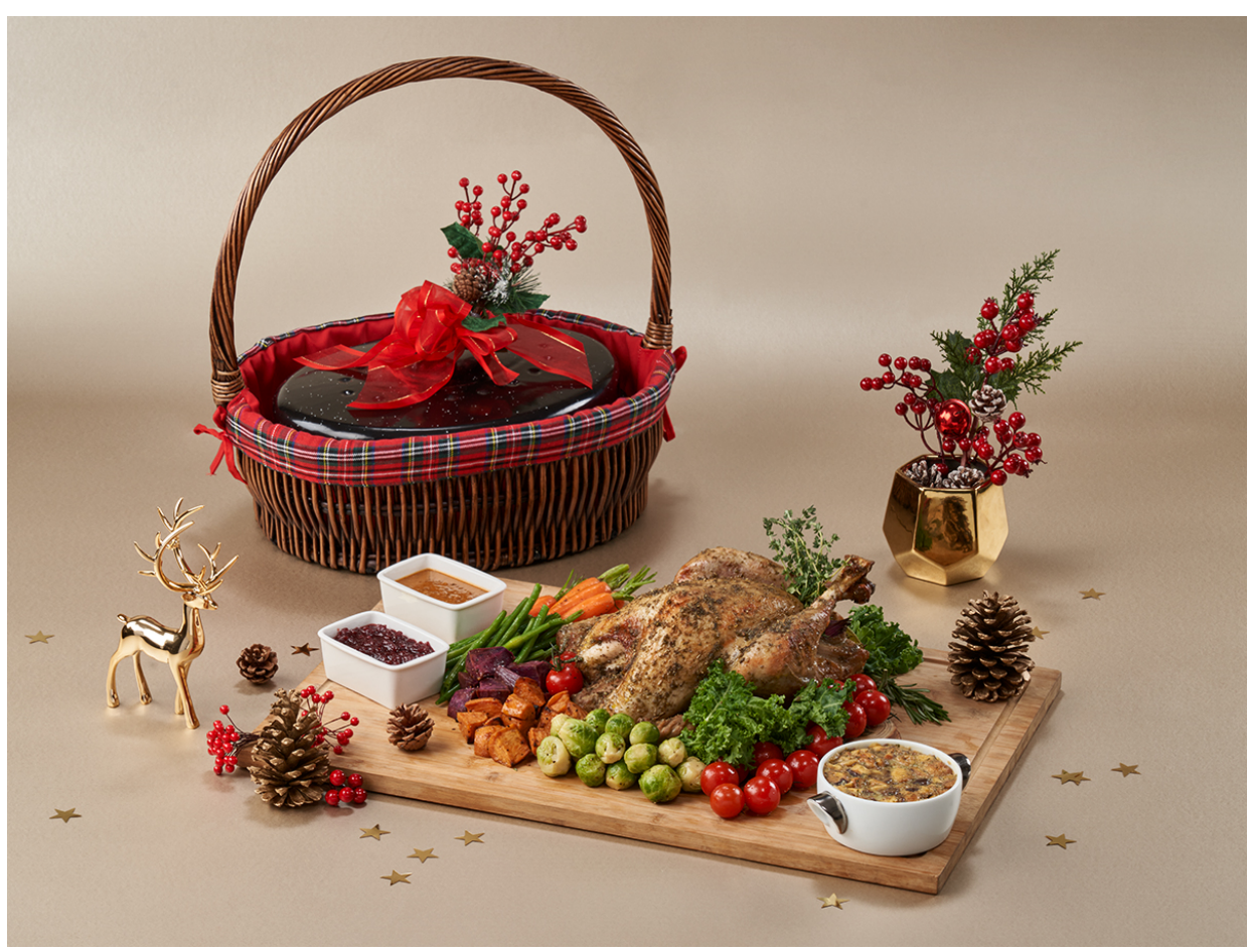
Traditional Whole Roast Turkey

In this season of joy, Resorts World Sentosa presents an exquisite array of yuletide delights across its dining establishments and retail offerings. From artisanal sweet treats to traditional roasts, guests can indulge in a carefully curated selection of festive favourites.