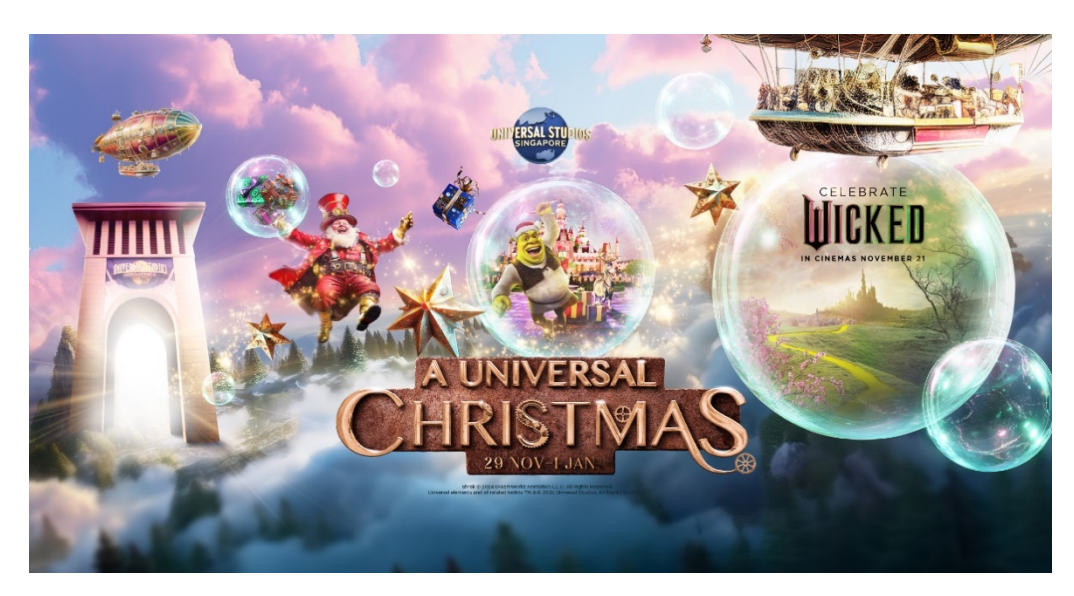
A Universal Christmas at Universal Studios Singapore

Also not to be missed, A Universal Christmas will make an enchanting return to Universal Studios Singapore at Resorts World Sentosa with a thrillifying celebration of Wicked – Universal Pictures' highly-anticipated film, in theatres November 21 – along with other festive encounters and dazzling decorations. From 29 November 2024 to 1 January 2025 , guests will find themselves transported to the streets of the Emerald City, welcomed into the different worlds of favourite DreamWorks characters, and the immersed in steampunk-inspired Santa's Mechanical World.