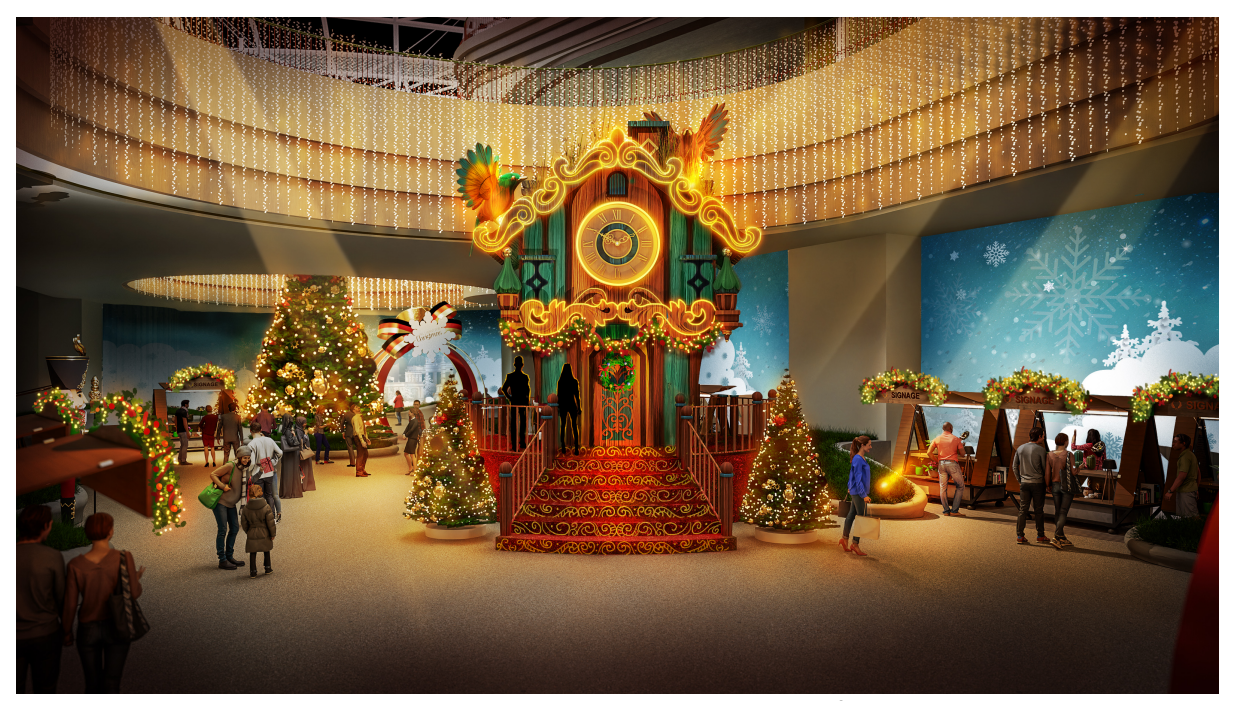
German Cuckoo Clock at A Big Carnival of Joy

Experience epic fun at the merriest carnival in town with RWS' A Big Carnival of Joy from 7 December 2024 to 2 January 2025. Embark on a whimsical journey through specially curated country zones – England, France, Germany and Japan – each teeming with iconic attractions, thrilling carnival fun, and artisanal stalls brimming with delectable holiday goodies and unique handcrafted gifts that bring the spirit of global Christmas traditions to life.