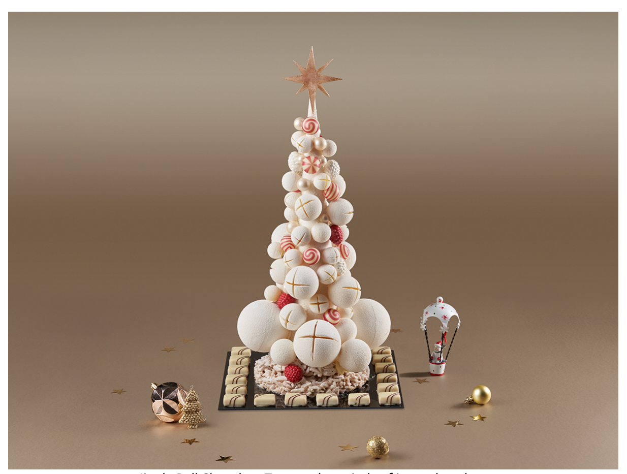
Jingle Bell Chocolate Tree made entirely of ivory chocolate.

Along with the Christmas Roasts collection, delectable holiday treats such as the Jingle Bell Chocolate Tree are also available via Oddle or at the festive booth in the Hotel Ora lobby. A magnificent centerpiece, the Jingle Bell Chocolate Tree—made entirely of Grand Cru Dark or Ivory chocolate—is not just a feast for the eyes; it's a gourmet experience. The extensive selection also includes a range of artisanal chocolates to classic Christmas confections.