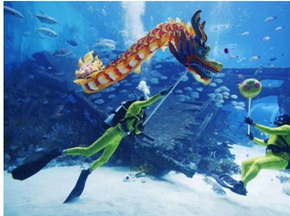
2023 underwater dragon dance at the Shipwreck habitat in S.E.A. Aquarium.

A highlight of the celebration is the Underwater Dragon Dance Presentation (龙腾四海) at the Open Ocean Habitat in S.E.A. Aquarium, which depicts the dragon conquering all oceans. This breathtaking performance is more than a visual feast, it symbolises aspirations for excellence and success, blessing guests with fortune and vitality. The underwater dragon dance presentation will take place daily from 26 January till 25 February 2024 at 3.30pm.