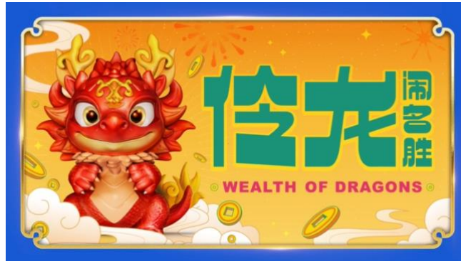
Snap fun Insta-worthy selfies worth sharing with Resorts World Sentosa's lucky dragons along AVE8.

A soloist gracefully navigates the crowd recounts his narrative, accompanied by captivating dancers. The 88m LED dragon then makes its hugely anticipated appearance and blesses the crowd. Set at the Lake of Dreams (梦之湖) of Level One at the Forum (福廊), the event is scheduled on 10 (Saturday) to 13 February (Tuesday) as well as 16 (Friday) to 18 February 2024 (Sunday) at 7.30pm and 8.30pm. Guests can look out for the God of Fortune on these dates too making special appearances as a pre-show item.