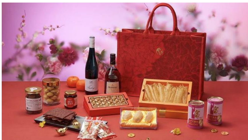
The Premium Hamper is available for S$888 at Resorts World Sentosa.

Diners can complete the festive feast with the Golden Ingot Nian Gao (喜事连连金元宝年糕) (S$16++ for three pieces). These ingot-shaped glutinous rice cakes symbolise good fortune and wealth, offering a subtle coconut aroma that complements the chewy texture of the dessert.