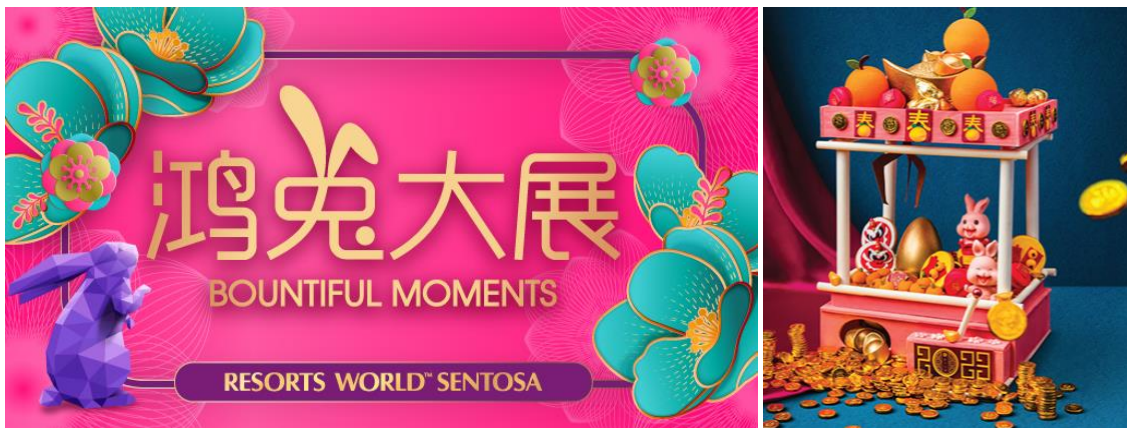
Enjoy bountiful moments at Resorts World Sentosa this Year of the Rabbit or bring prosperity into your home with the limited-edition Bountiful Bunnies "Claw machine" and other lovingly created treats (above right).

Look forward to an LED Dance of the Dragon, Singapore's only underwater dragon dance, auspicious feasts and festive goodies by award-winning chefs plus a new restaurant opening