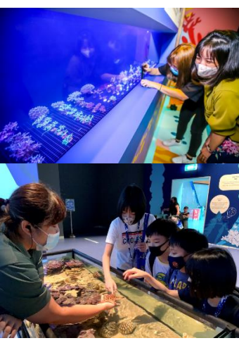
(Left) An aquarist places a poison arrow frog into its new home at the Rainforest habitat. (Top right) Hundreds of colourful coral fragments on display at the Coral Reef habitat. (Bottom right) Guests come face-to-face with intertidal marine residents such as the epaulette shark and knobby sea star at the Discovery Pool.

SINGAPORE, 6 October 2020 – Marine animal lovers will be greeted with a larger, more spacious and refreshed S.E.A. Aquarium (SEAA) at Resorts World Sentosa with the addition of a new immersive zone that extends the visitor journey from the tropical rainforest and intertidal coastal terrains before descending upon the underwater cities of brightly-hued coral reefs. Offering plenty of open spaces for guests to circulate and view the exhibits with safe management measures in place, the enhanced zone will intrigue young and old with its eye-catching educational displays that inspire marine conservation. As life gradually transitions to a new norm in Singapore, the calm and serenity of the past months have also breathed new life among our aquatic animals with several exciting newborns, some of which are residents at the new zone.