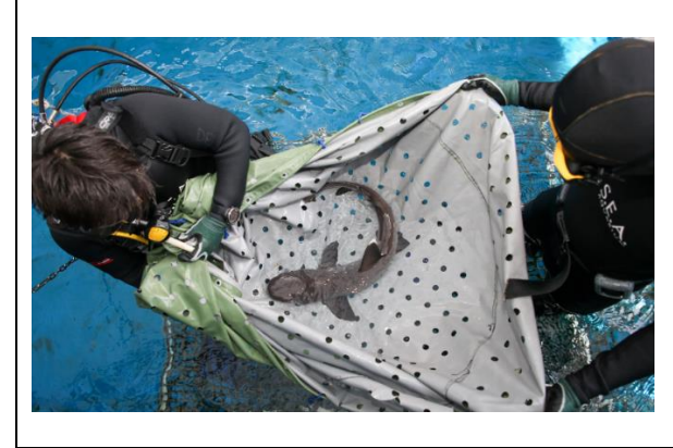
White-tip reef shark Triaenodon obesus