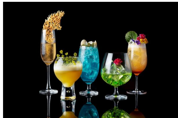
Handcrafted cocktails in vibrant colours of ocean flora and fauna