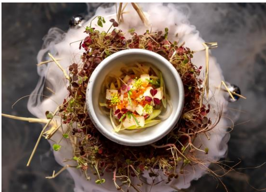
Misty Morning Sea