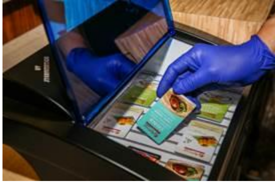
Room keycard UV sterilisation