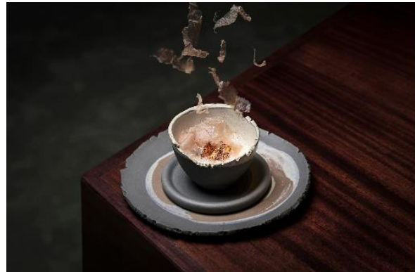
table65's Mozambique Langoustine with Bonito Flakes has won many fans over

More details on the four staycation packages can be found in the Annex .