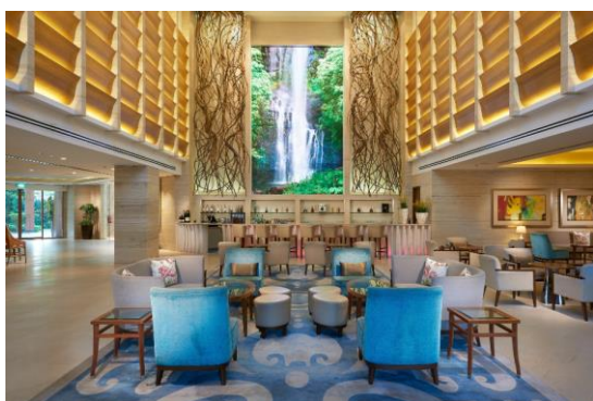
Situated along the fringe of a tropical rainforest, eco-luxurious Equarius Hotel is perfect for nature lovers

Astound your date or partner with the experience of a lifetime with a mod-Asian dinner for two at Ocean Restaurant (海之味水族餐厅), the one-and-only underwater dining sensation in Southeast Asia in the company of graceful manta rays, mighty sharks and over 40,000 marine animals of the S.E.A. Aquarium.