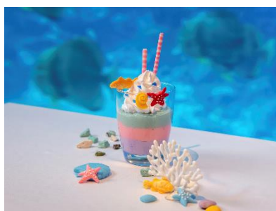
Little ones are in for a treat with complimentary Mermaid Ice Cream Sundae at Ocean Restaurant