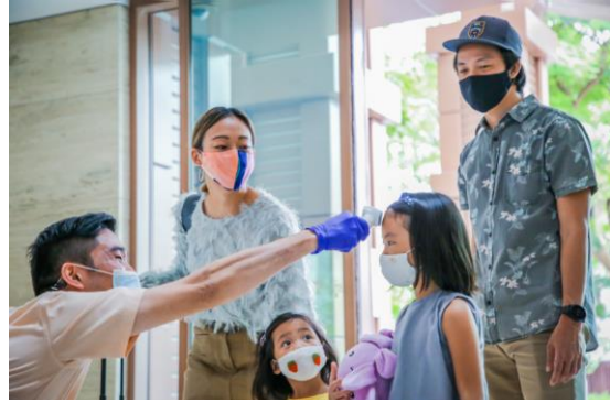
Temperature scans for a family of guests

Certified SG Clean, RWS's hotels welcome guests into a sanctuary surrounded by the highest standards of sanitisation and hygiene based on the three principles of Safe Entry , Safe Experience and Safe Environment .