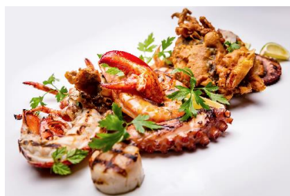
Osia's famed Seafood Platter