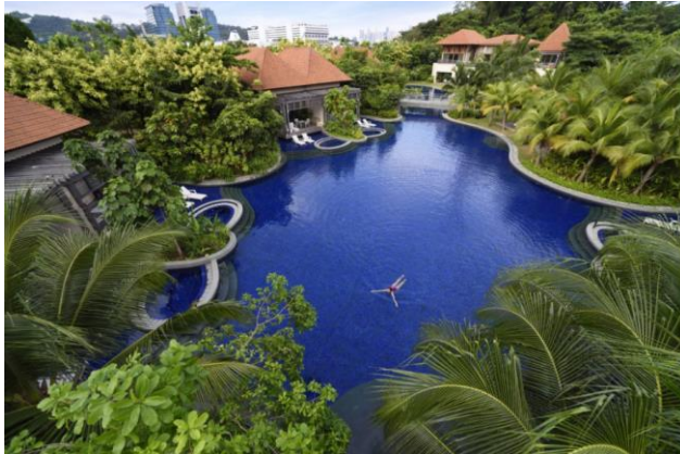
The 1-Bedroom Beach Villas offer private timber sun decks and verandahs that open out to a stunning free form pool

For the ultimate rejuvenation and well-earned getaway in style, you can pamper your tired bodies and spoil yourself silly with an exclusive and indulgent respite set in a secluded tropical sanctuary at Beach Villas that offers personalised service like no other, spectacular views, and luxurious comforts.