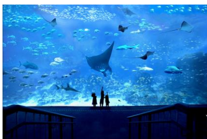
Discover the wonders of the marine world at S.E.A. Aquarium