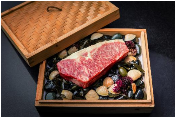
table65's A5 Ohmi Wagyu has been a blockbuster and signature main course

Complete the staycation with a dinner at One-Michelin starred table65 , famed for its out-of-this-world gastronomic creations, theatrical dining experience and charismatic chefs who will charm your socks off. The fine-casual restaurant offers diners front-row counter seats with full view of the affable chefs in action. Complementing the immersive, interactive and exciting dining experience at table65 is a wine library of more than 2,000 specially curated labels.