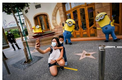
Meet Illumination's Minions at Universal Studios Singapore