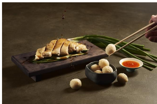
Malacca Chicken Rice Balls

For reservations, please call 6577 6599, email fengshuiinn@rwsentosa.com or visit www.rwsentosa.com/fengshuiinn .