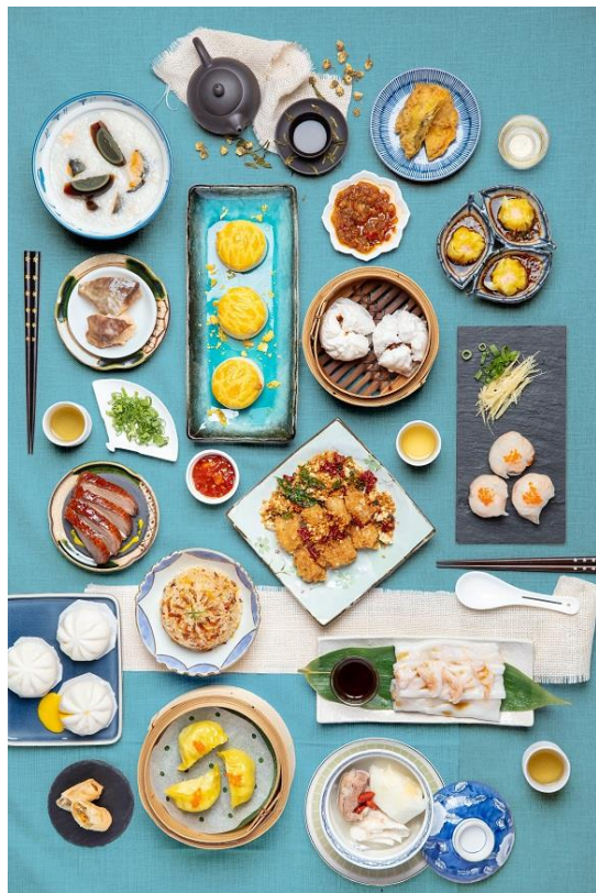
A la carte Dim Sum selection