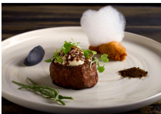
Wagyu Beef Tenderloin

For reservations, please call 6577 6869, email ocean@rwsentosa.com or visit www.rwsentosa.com/oceanrestaurant .