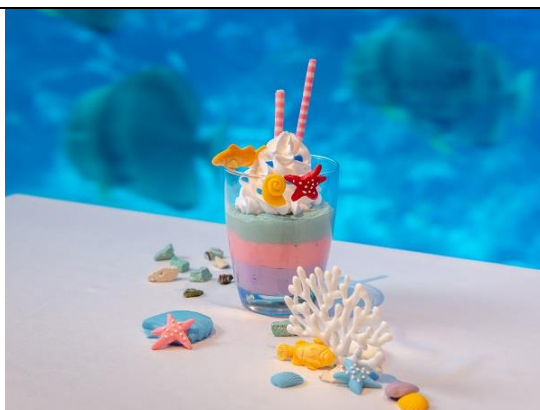
Mermaid Ice Cream Sundae, complimentary for the little ones

family-friendly restaurant. To top off the magical experience for them, each child can enjoy a complimentary marine-themed dessert of their choice – Mermaid Ice Cream Sundae made from a delicious composition of organic low-fat milk, yoghurt, berries and vanilla; or an Ocean Jello Cup with fresh blueberry-brewed butterfly pea flower tea served with lemon-scented ivory chocolate whipped ganache and a crunchy cashew crumble.