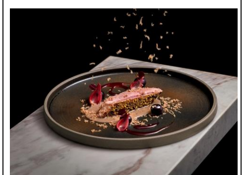
table65's special 5-course Valentine's Day dinner ($$378++ per couple) comprises exquisite and flavourful gastronomic creations prepared with precision that reveal a mix of French, Dutch and Japanese influences.

For couples who fancy fine-dining without the stuffiness, the Michelin-starred table65 headlined by Dutch celebrity chef Richard van Oostenbrugge offers the perfect combination of sophisticated cuisine, friendly service and a fun and relaxed ambience. Sit at the large custom-designed chef's table and enjoy the energetic action in the sleek open kitchen as each dish is beguilingly presented to your table by the approachable chefs.