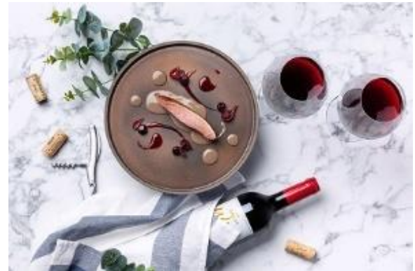
Roast Duck Breast with Berries, Sauce Royale and Oxalis is one of the dishes that can be enjoyed at The GREAT Wine & Dine Festival from RWS celebrity chef restaurant, table65.