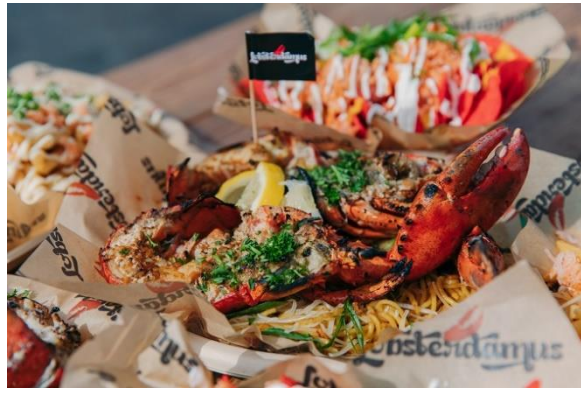
The GREAT Wine & Dine Festival is bringing in Lobsterdamus, a cult food stand from Los Angeles best known for its Lobster Fries, Lobster Nachos and Grilled Lobster with Garlic Noodles.