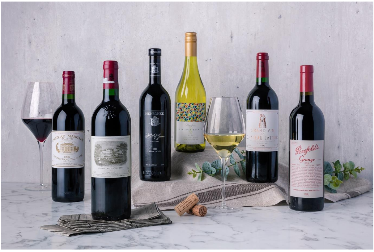
Nominees of the inaugural Wine Pinnacle Awards 2019 will be showcased during the three-day celebration.

Nominees announced for world's first-ever nomination-based wine award and festival featuring over 400 wines and sakes curated by top wine professionals