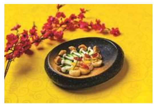
Sauteed Scallop with Monkey Head Mushroom and Wild Fungus