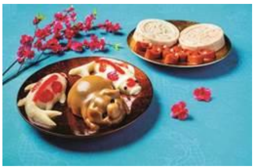
Feng Shui Inn goodies – Traditional Golden Pig "Nian Gao"