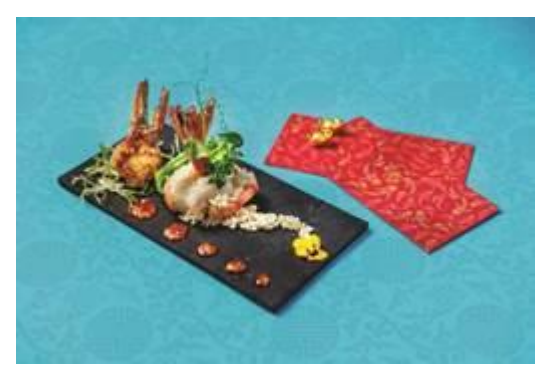
King Prawn Wok Fried with Minced Pork and Rice Wine accompanied by Cracker