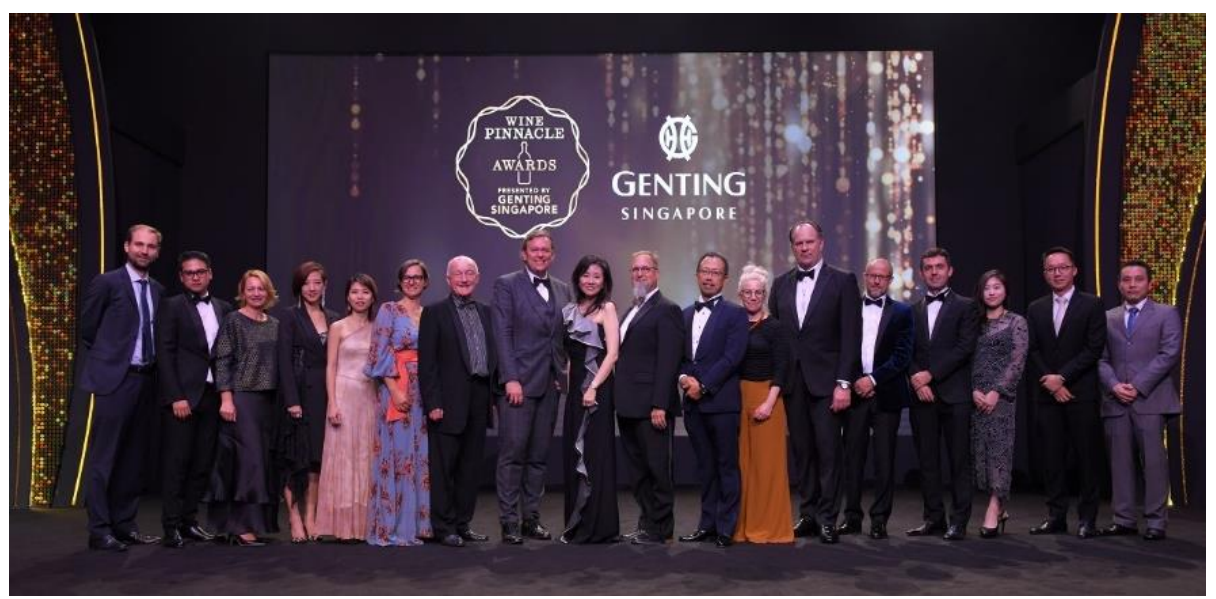
Award winners and committee members of the inaugural Wine Pinnacle Awards 2019

Results for the world's first-ever nomination-based wine award features a diverse and inclusive list cutting across geography and vintage, while highlighting sustainable practices