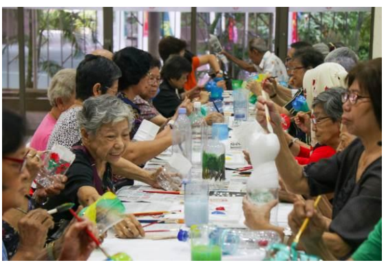
(Left photo) RWS volunteers (in yellow) and staff from KL Enviro (in blue) sorting out recyclables from unwanted items from the rental homes of Lengkok Bahru. (Right photo) Residents from Queenstown Division participating in an upcycling workshop conducted by RWS volunteers.

In the weeks leading to the event day, RWS volunteers had spent time on the ground, visiting the residents and befriending them to understand their needs at a deeper level. Volunteers were also trained on proper waste management techniques on segregating dry from wet waste for more effective recycling.