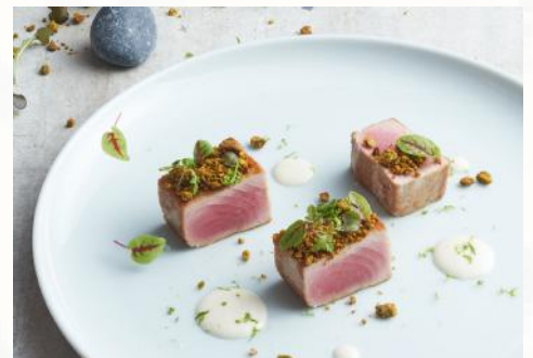
Tonno Tataki, Bagna Cauda, Crumble di Pistacchio

Exciting new dishes making their debut include 'Capellini topped with Mentaiko and Nori' (by Osia Steak and Seafood Grill), 'Chilli Crab with Sakura Ebi Spring Onion Pancake' (by Tung Lok Heen) and 'Tonno Tataki, Bagna Cauda, Crumble di Pistacchio' (by Fratelli Trattoria).