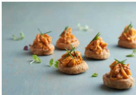
Chilli Crab with Sakura Ebi Spring Onion Pancake