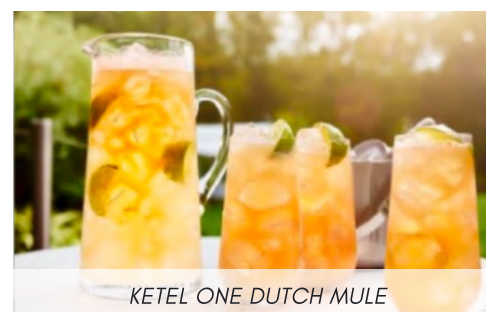
KETEL ONE DUTCH MULE