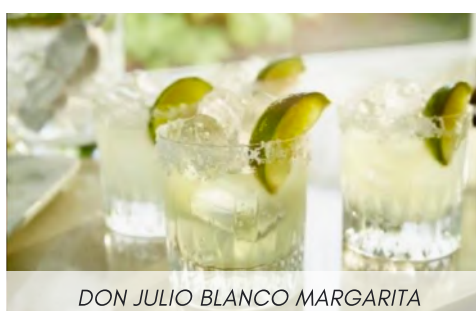
DON JULIO BLANCO MARGARITA