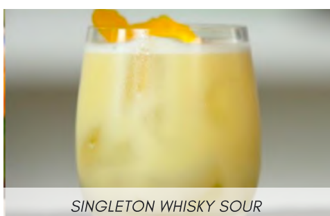
SINGLETON WHISKY SOUR