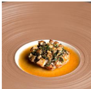
Scallop with Black Truffle and Fermented Oxtail Jus