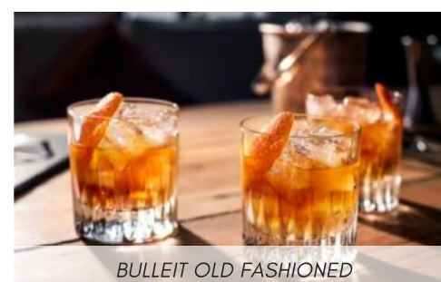
BULLEIT OLD FASHIONED