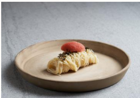
Capellini topped with Mentaiko and Nori