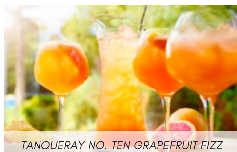
TANQUERAY NO. TEN GRAPEFRUIT FIZZ