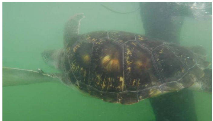
Louie the green sea turtle (pictured in both images) swam immediately in the waters of Pulau Semakau after its release. Both Hawke and Louie were tagged and microchipped so they can be identified should they return to Singapore's shores in the future.