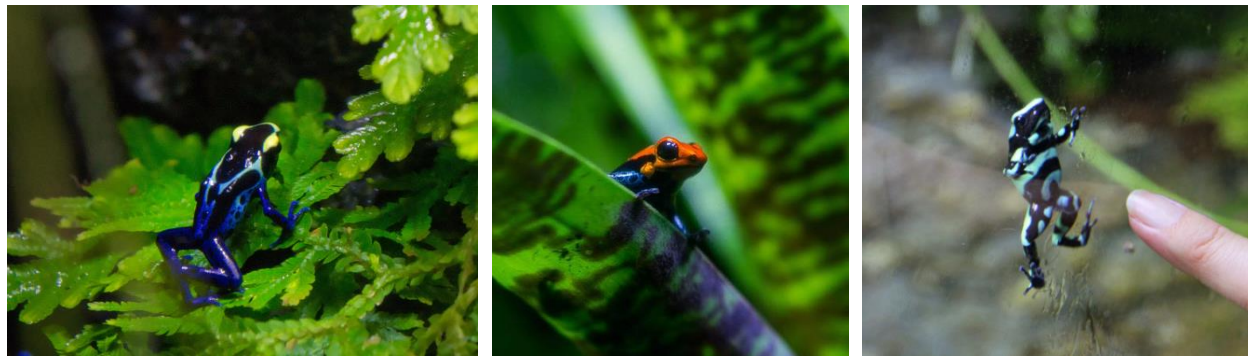
The beautiful but deadly poison arrow frogs are the latest residents and first amphibians to be showcased in S.E.A. Aquarium, as part of its long-term animal collection plan to exhibit new and unique species for conservation awareness on the diversity of marine life. The aquarium is home to over 40 poison arrow frogs from five species, including the dyeing (left), Amazonian (centre) as well as green and black (right) species.

Little but lethal species the first amphibians to be showcased as part of the aquarium's extensive collection of aquatic creatures