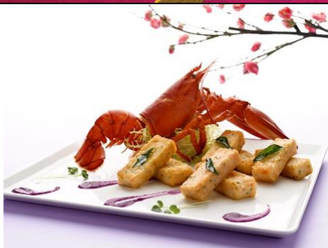
Deep-fried "Live" Boston Lobster Roll with Purple Sweet Potato Sauce and Butter Cream 鲤耀龙门•奶油紫薯汁波士顿龙虾件 Available a la carte at S$58++ (Small), S$87++ (Medium), S$116++ (Large)

takeaway), featuring fresh sliced abalone, Sea Cucumber, Premium "Lau Fau Shan" Dried Oysters, Whole Conpoy, "Live" Prawns, German Pork Knuckle, Roasted Pork, Japanese Mushrooms, Kurobuta Pork and East Star Grouper