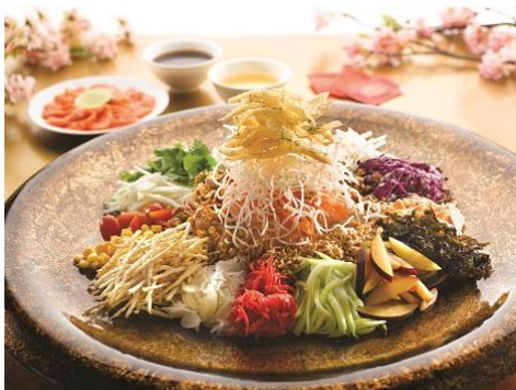
Signature Salmon Yu Sheng with Crispy White Bait Tossed with Homemade Citrus Yuzu Honey Lime Dressing 发财三文鱼捞起 Small: S$78++ (2 to 4 persons), Medium: S$98++ (5 to 8 persons), Large: S$118++ (9 persons and above) (Forest 森's Chinese New Year set lunch and set dinner menus include the Signature Salmon Yu Sheng)

Feng Shui Inn is located on Level G2 of Crockfords Tower in RWS. For reservations, please call (65) 6577 6688 or email fengshuiinn@rwsentosa.com .