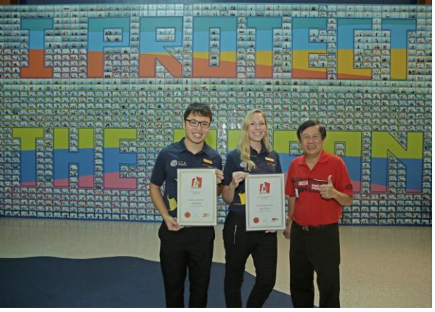
As part of World Oceans Day celebration, S.E.A. Aquarium at Resorts World Sentosa (RWS) today set two Singapore records for the largest bottle cap mural (LEFT) and the largest photo pledge wall (RIGHT), in a bid to inspire marine conservation.

SINGAPORE, 23 June 2016 – As part of World Oceans Day celebration, S.E.A. Aquarium at Resorts World Sentosa (RWS) today set not one, but two Singapore records for the largest bottle cap mural and the largest photo pledge wall, in a bid to inspire marine conservation. The two records were collectively achieved by visitors to the aquarium and RWS team members who took six days to assemble the two structures and earn the titles in the Singapore Book of Records.