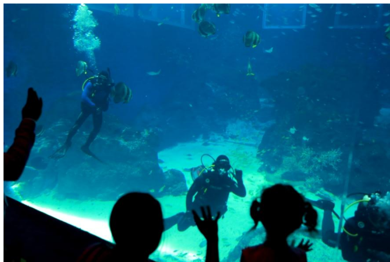
Guests waving to divers through the world's largest acrylic panel; the new Open Ocean Dive programme immerses the divers in the world's largest aquarium.