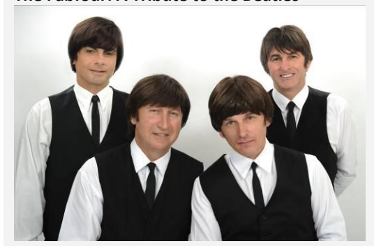
The Fabfour: A Tribute to the Beatles

This show has performed throughout the country and Asia including 5 Leeuwin concerts performing alongside such greats as Shirley Bassey and George Benson. With costumes representing all era's of the Beatles and authentic instruments that re-create that special sound that changed the world of popular music, The Fabfour will take you on an unforgettable nostalgic ride from 1962 to 1969.