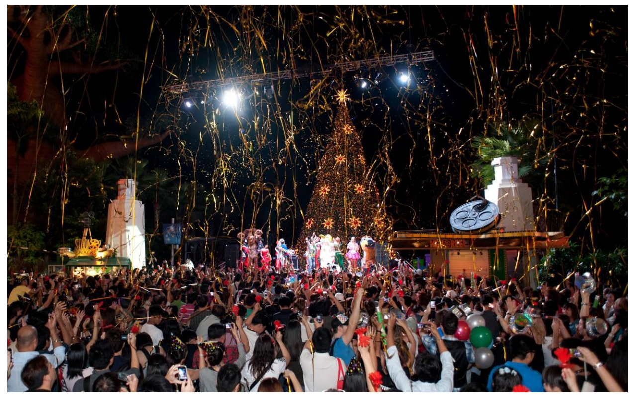
Usher in 2012 with the whole family at Universal Studios Singapore, Resorts World Sentosa.

3.