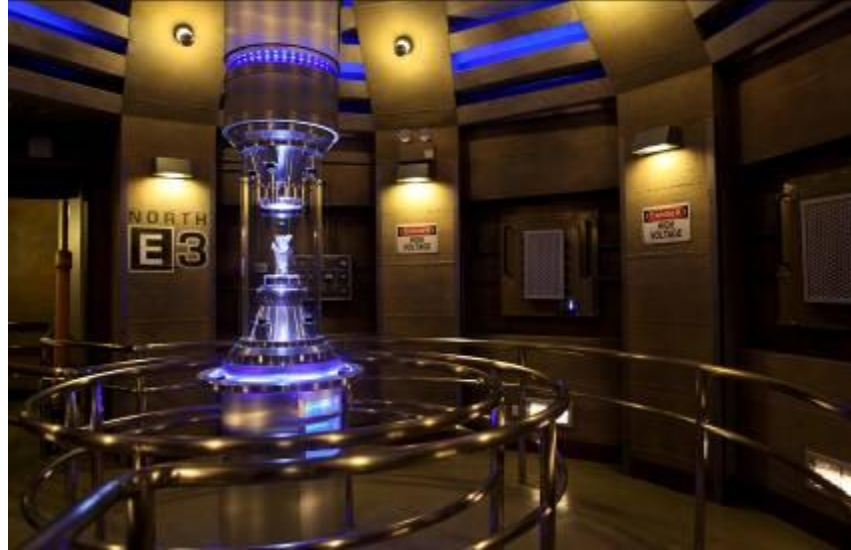
The ALLSPARK Shard – what the new recruits (guests) will need to protect from MEGATRON and the DECEPTICONS.