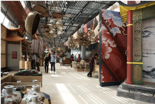
The Souk Gallery, where visitors can experience the sights and sounds of the ancient markets found at various ports of call along the Silk Route.