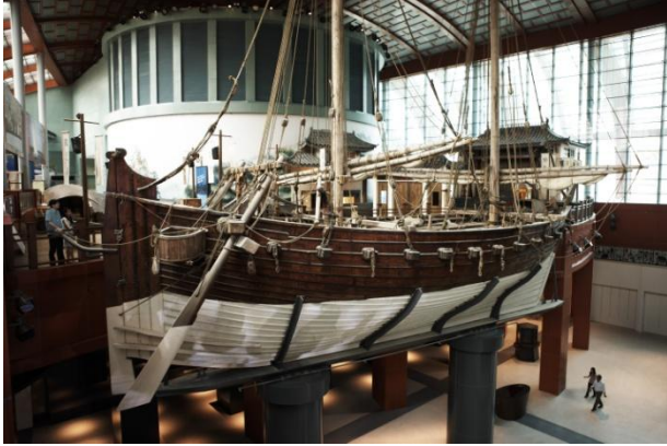
The Jewel of Muscat, a replica of a 9 th century dhow