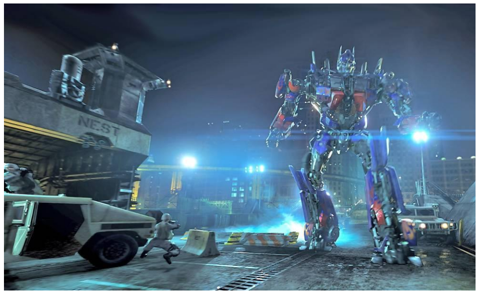
Optimus Prime, leader of the Autobots, prepares for battle with the Decepticons.