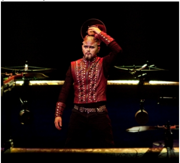
Death summons the Boy to an important lesson in the Circle of Life and Death. With 16 flaming arrows pointed directly at one target, a single apple above his head, the Boy learns that to live life to the fullest, he must face the fear of death bravely.