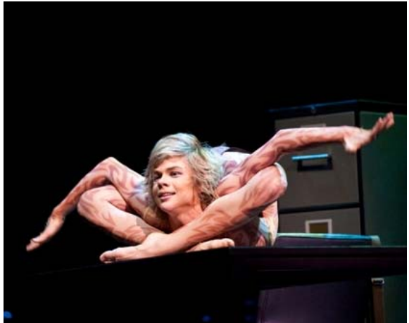
A friendly and mischievous sprite, The Game Master leads the Boy into the world of his imagination by challenging belief and inciting wonder and amazement. He reappears throughout the show as he accompanies the Boy on his journey.