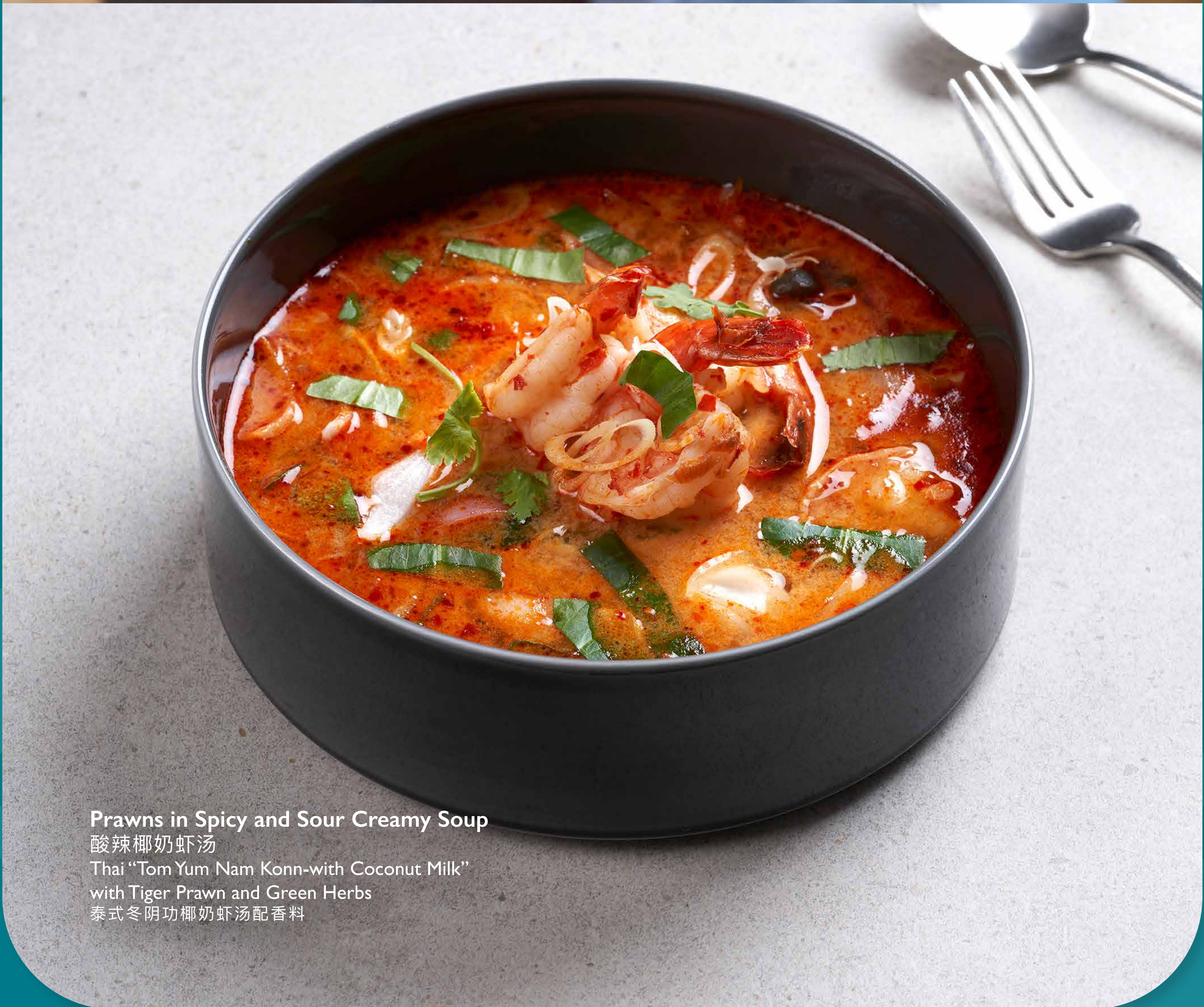
Prawns in Spicy and Sour Creamy Soup 酸辣椰奶虾汤 Thai "Tom Yum Nam Koon-with Coconut Milk" with Tiger Prawn and Green Herbs 泰式冬阴功椰奶虾汤配香料