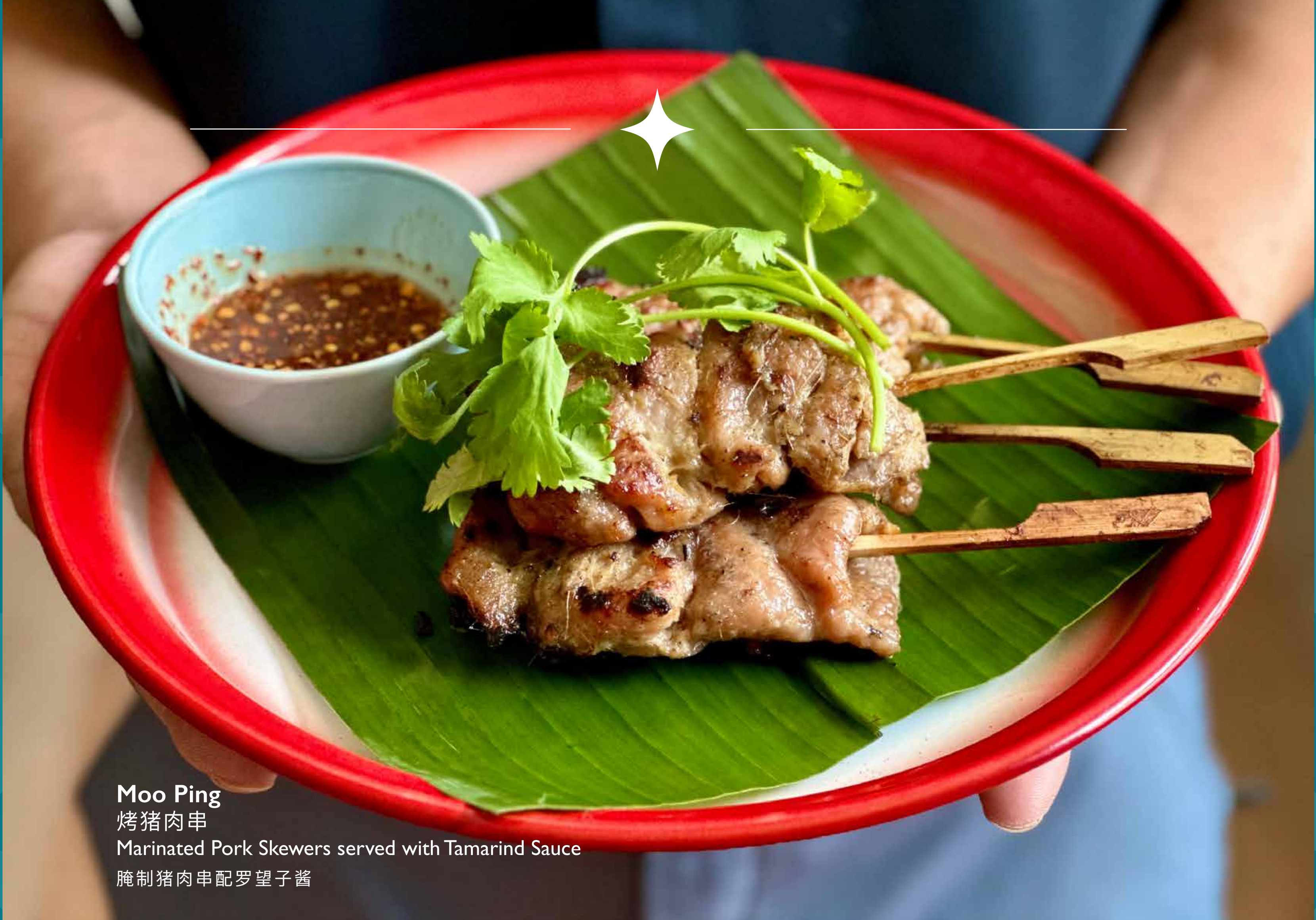
Moo Ping 烤猪肉串 Marinated Pork Skewers served with Tamarind Sauce 腌制猪肉串配罗望子酱