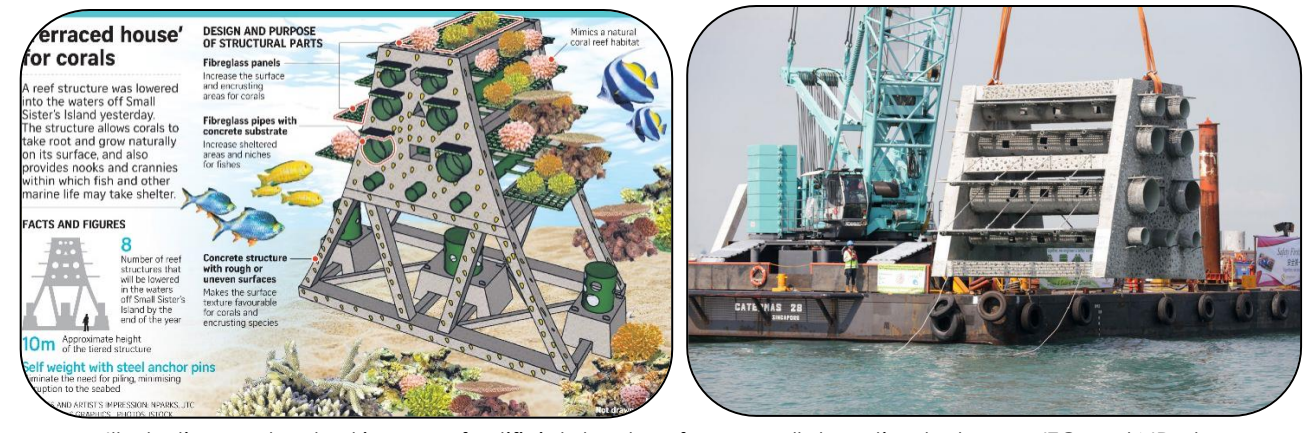
Illustration and actual image of artificial structure from a collaboration between JTC and NParks

To restore reefs, artificial structures made of pre-fabricated concrete and recycled rocks were placed within the Sisters' Islands Marine Park.