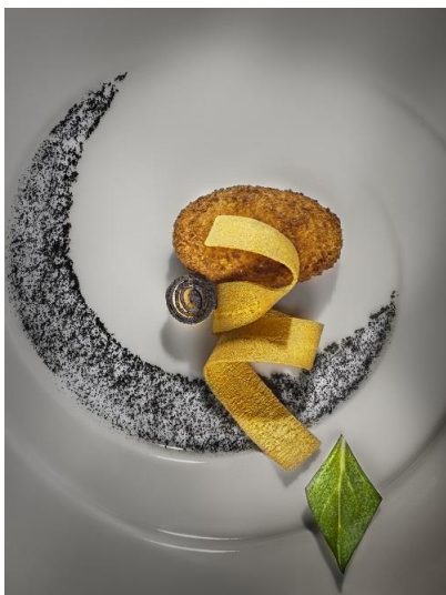
Breaded oyster, apple with burnt and golden touch (above): An elaboration of the traditional Spanish croqueta, an oyster is wrapped with béchamel and diced oyster, and coated with a delicate layer of panko.

Please use the following photo captions for visuals. High resolution photos can be downloaded from this link: https://app.box.com/v/Curate