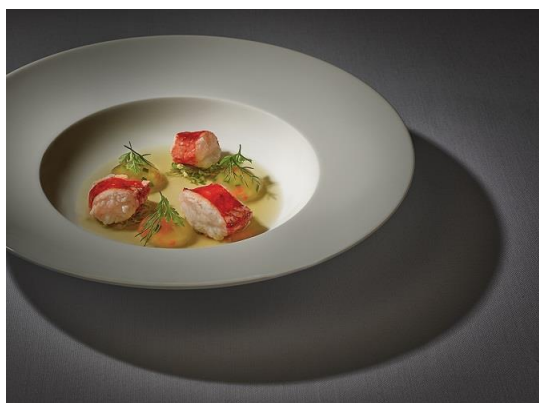
King crab with saffron bouillabaisse with roes, liquid transparence (above): A traditional stew of Mediterranean heritage revised to create a subtle and elegant dish with the purest flavour. The essences of the sea is concentrated in a delicate bouillabaisse that accompanies and enhances the king crab.