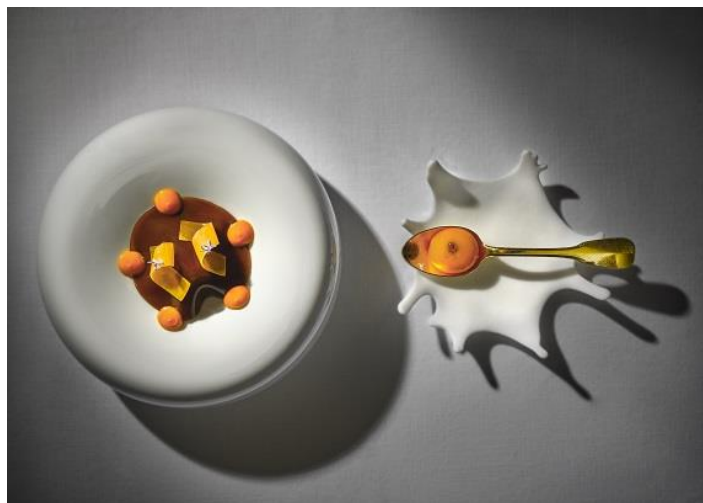
Under a black garlic veil: mushrooms, Iberian ham and lobster, free range egg yolk with Sherry wine (above): Under a black garlic veil and pumpkin sheets is a surf and turf stew made of lobster, Iberian ham and sautéed mushrooms. A free range egg yolk infused with sherry wine is served on the side which captures the essence of Southern Spain.