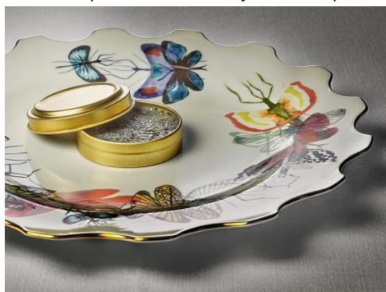
Tinned sturgeon with vegetable roes (above): This delightful appetizer plays on the concept of "trampantojo" which means food that tricks the eye. Featuring a pesto gelee base, the fumet infused basil seeds are made to look like caviar.