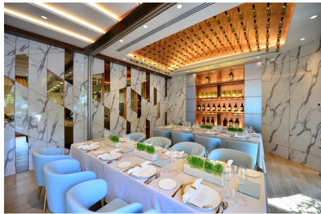
CURATE , which debuted in April 2016, complements the diversity of cuisines offered by the four Michelin-starred restaurants housed in RWS.